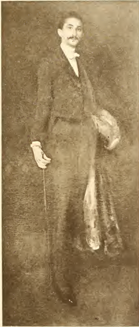
Arrangement in Black and Gold. "LE COMTE ROBERT DE MONTESQUIOU- FEZENSAC."